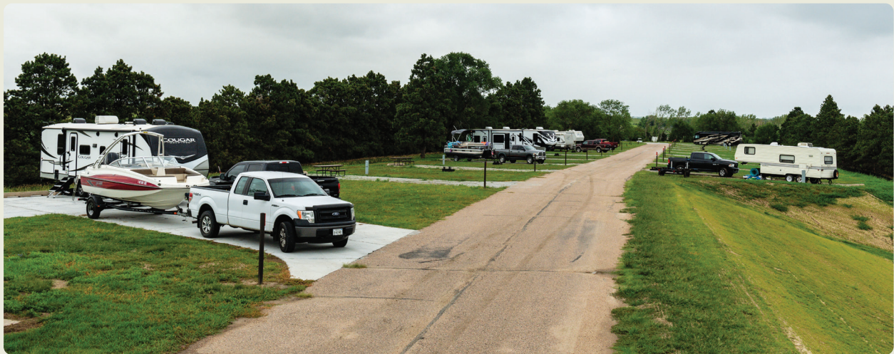
The campground at Sherman Reservoir State Recreation Area was expanded in fiscal year 2023-24 using Capital Maintenance Fund and park cash dollars.