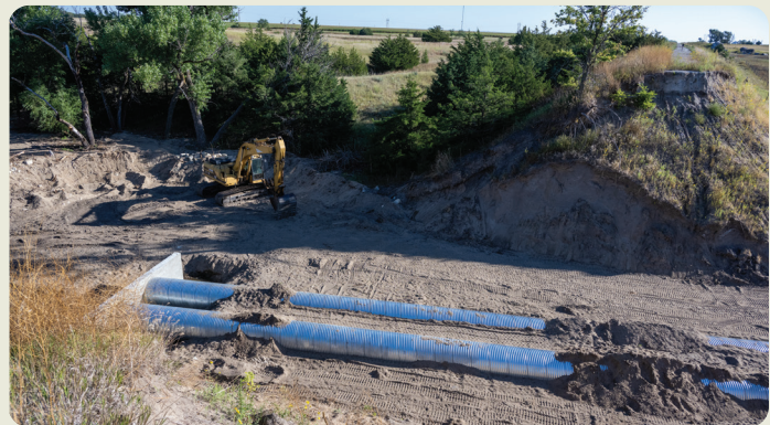
(Left) A new vault toilet was installed at Long Pine State Recreation Area. (Right) Culverts are installed where flood damage occurred along the Cowboy Trail, west of Long Pine.