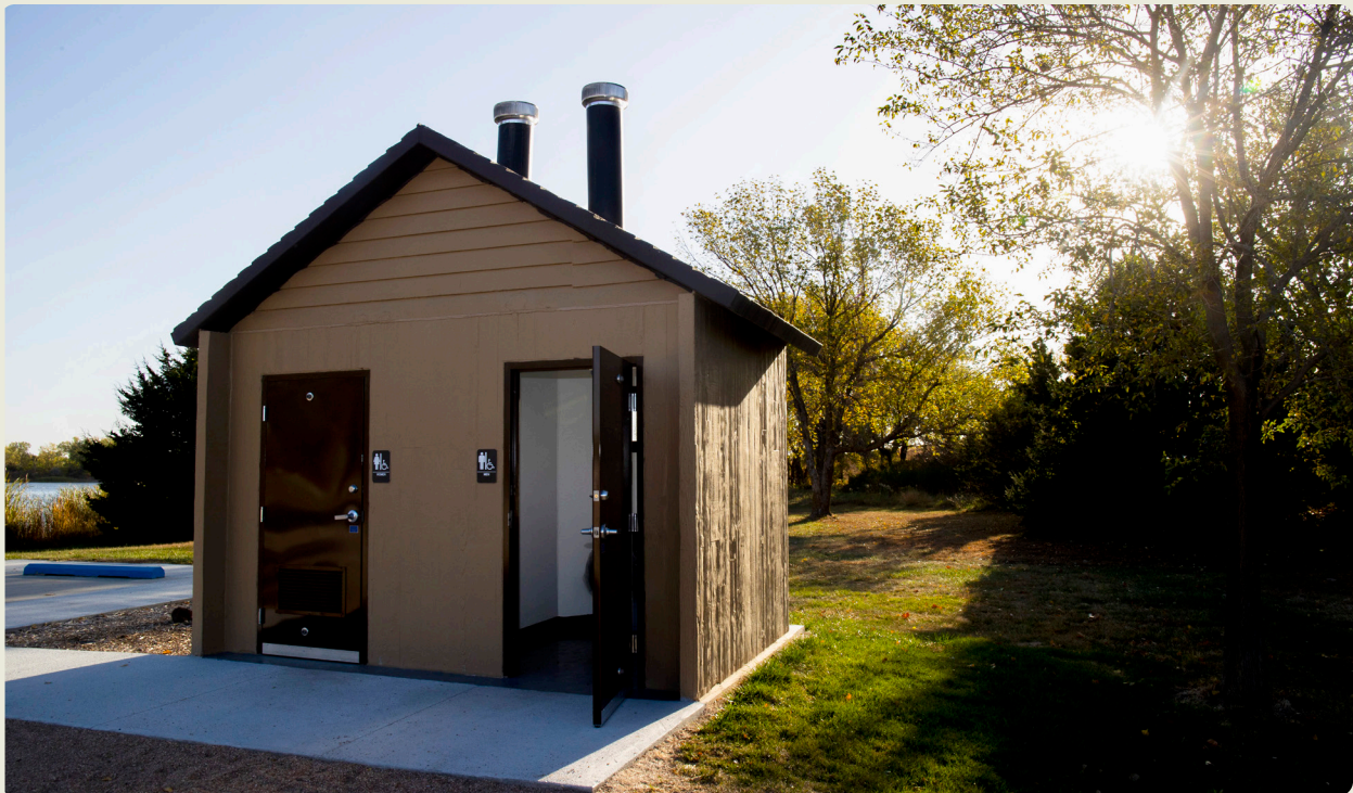
Mormon Island State Recreation Area received a new vault toilet using Capital Maintenance Fund dollars.

Capital Maintenance Fund dollars are spent on improvements at agency facilities statewide, and accomplishments to date have produced numerous positive comments.