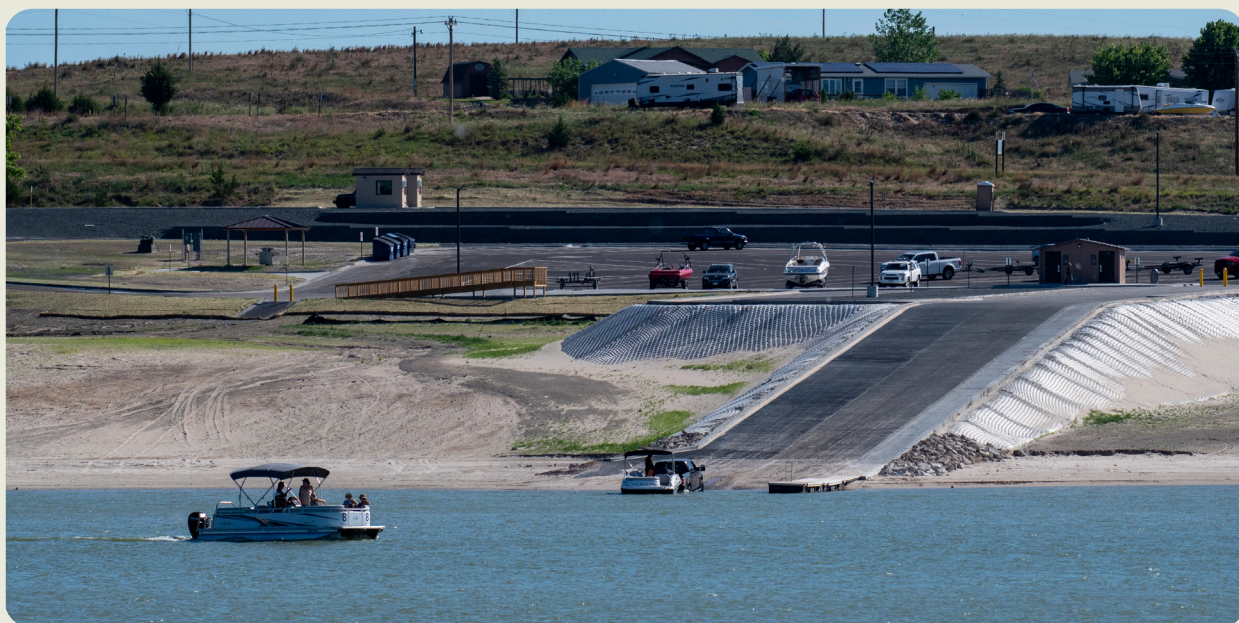
An improved boat ramp, parking lot and Americans with Disabilities Act-compliant ramp in Martin Bay are part of a Motorized Water Trails project at Lake McConaughy State Recreation Area in Keith County. This phase of the project, completed in May 2022, was funded partially by the Capital Maintenance Fund.