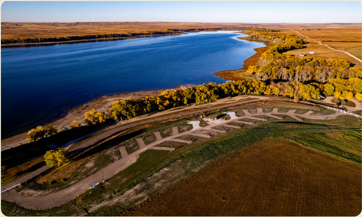
Box Butte State Recreation Area campground in Dawes County is getting access and traffic flow improvements at its most popular entrance. Campground improvements, including Americans with Disabilities Act-compliant sites, showerhouse and dump station, will better serve campers and anglers visiting western Nebraska's popular Box Butte State Recreation Area.