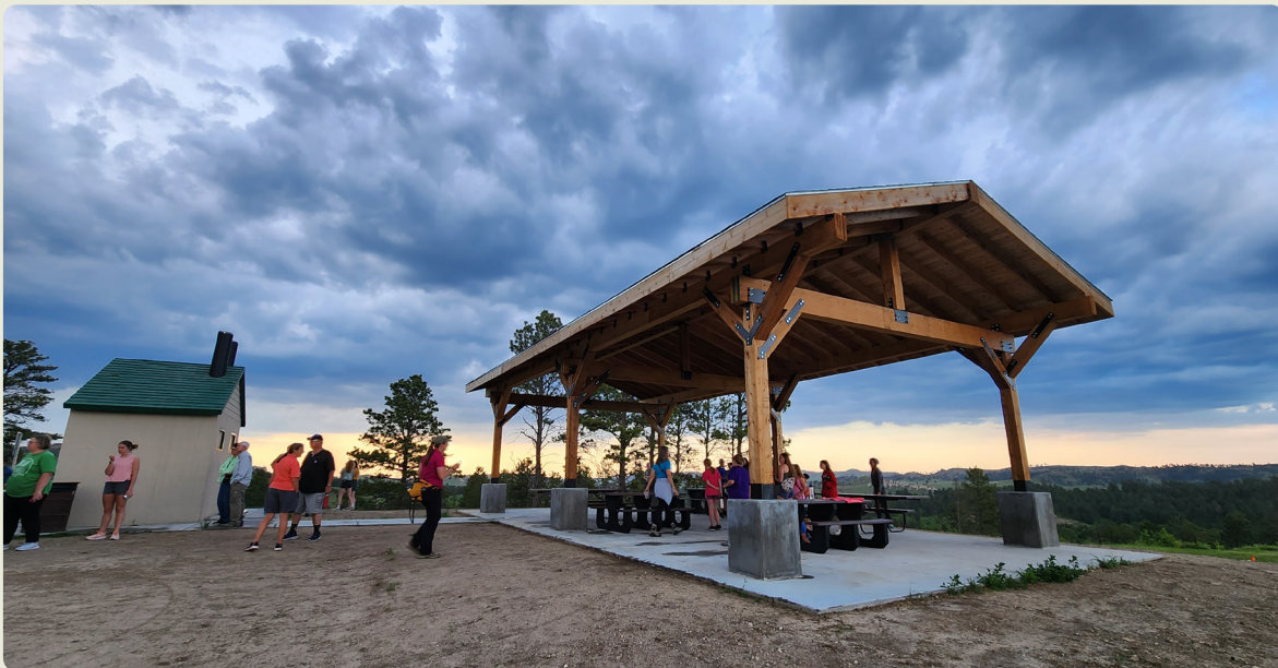
Participants gather at the new Pinecone Shelter for a Wildflower Week event at Chadron State Park. The shelter was made Americans with Disabilities Act-compliant in fiscal year 2022-23 using Capital Maintenance Fund dollars and park cash that included a donation by the Nebraska Game and Parks Foundation.

Capital Maintenance Fund dollars are spent on improvements at agency facilities statewide, and accomplishments to date have produced numerous positive comments.