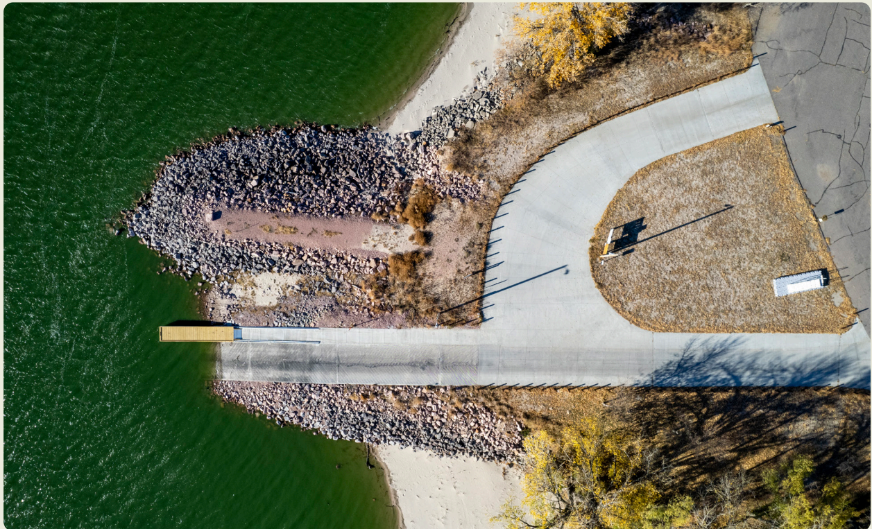
To improve boater access, improvements to the boat ramp and breakwater area were completed at the Main Area of Merritt Reservoir State Recreation Area in Cherry County using Capital Maintenance Funds.

JUSTIN HAAG, NEBRASKA GAME AND PARKS COMMISSION