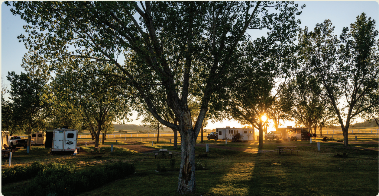
Fort Robinson State Park's Mare Barn Campground is being expanded to include 24 full-service sites, including American with Disabilities Act-compliant sites.