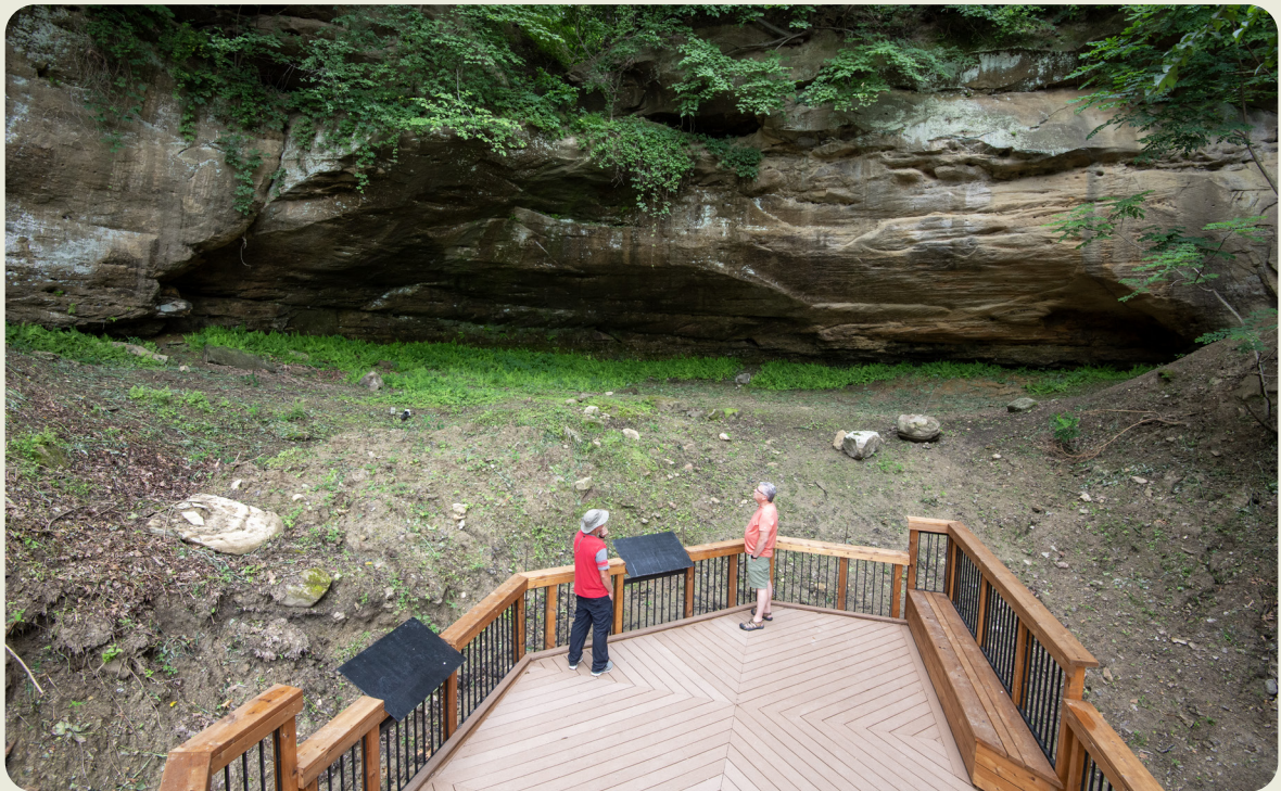
A new boardwalk and deck replaced a failing structure, giving visitors an up-close look at the iconic cave at Indian Cave State Park in Richardson County, while also protecting the historic petroglyph etchings. Visitors can reach the deck at the base of the cave via a stair tower or a ramp that is compliant with the Americans with Disabilities Act.