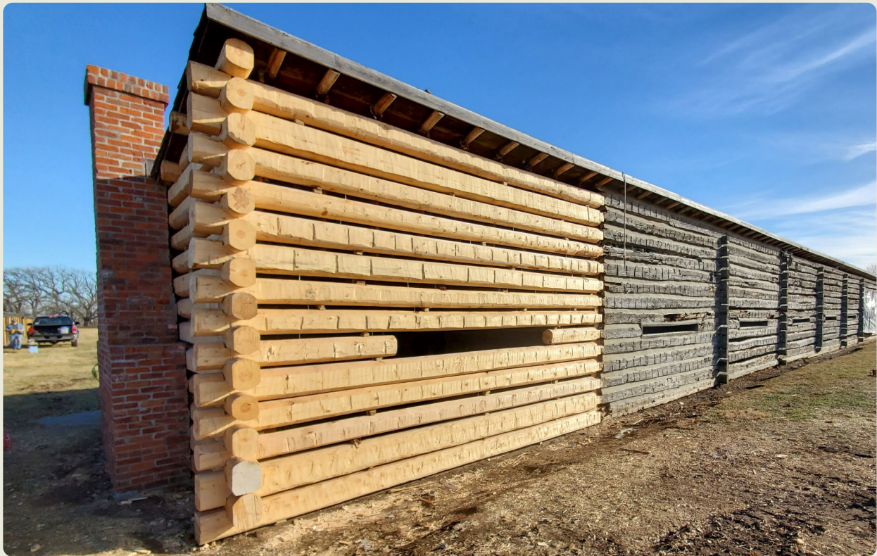
Replacing the logs in Fort Atkinson State Historical Park's historical structures has been a multi-year project funded in part by Capital Maintenance Funds. The park is near Fort Calhoun in Washington County.