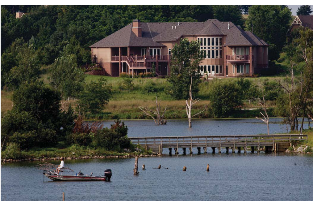
A largemouth bass angler fishes multiple cover options at Walnut Creek Reservoir in Papillion.

Special Restrictions- Boats restricted to 5 mph (no wake). Notes: A lake in its prime, it can give up large numbers or large fish. Early mornings and late afternoons can be spent catching bass on scum frogs and other topwaters, as