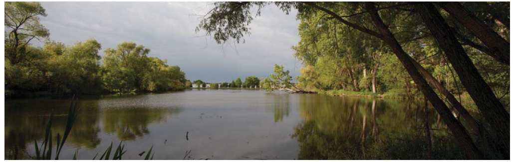
Throughout the Omaha area there are multiple fisheries with scenery as nice as the fishing, including Papillion's Schwer Park Pond.