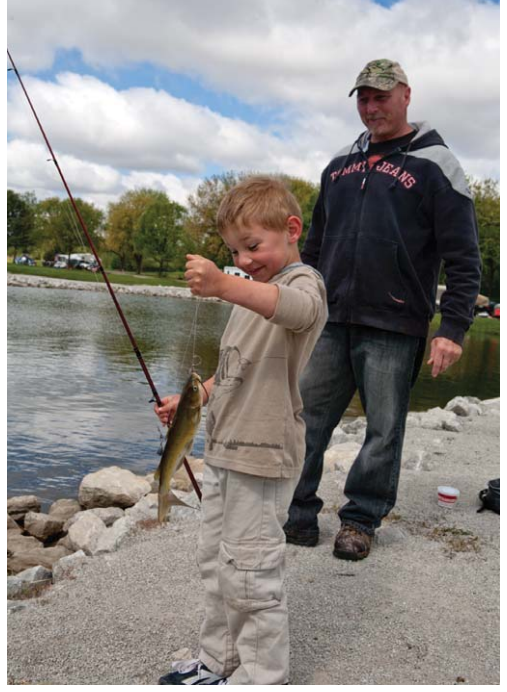
Multiple breakwaters at Glenn Cunningham make this lake a perfect camp-and-fish destination for families in the metro.