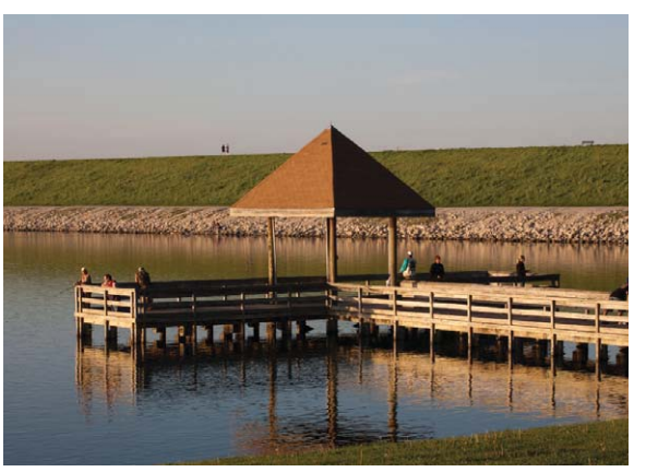
Newly re-opened Zorinsky Lake features a wheelchair-accessible fishing pier.

and nearly all of them are accessible by those willing to walk in the short grass around the lake.