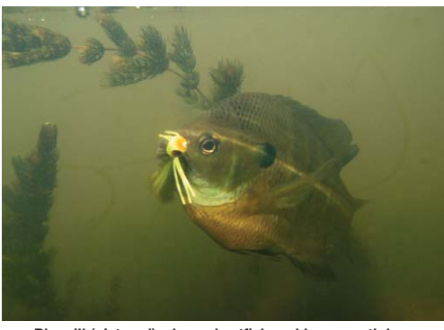
Bluegill (pictured), channel catfish and largemouth bass are species usually stocked throughout Omaha. Some waters will also have crappie and seasonally stocked rainbow trout.

Notes: Excellent water quality and clarity make this a great little pond. Lots of small crappie and catfish are the norm, but some big bluegill can also be found.