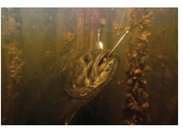
Quality largemouth can be found at multiple Omaha hotspots.

Don't shy away from the vegetation during the summer months, however. While more challenging to fish, exploding bass and bluegill populations have made it very worthwhile.