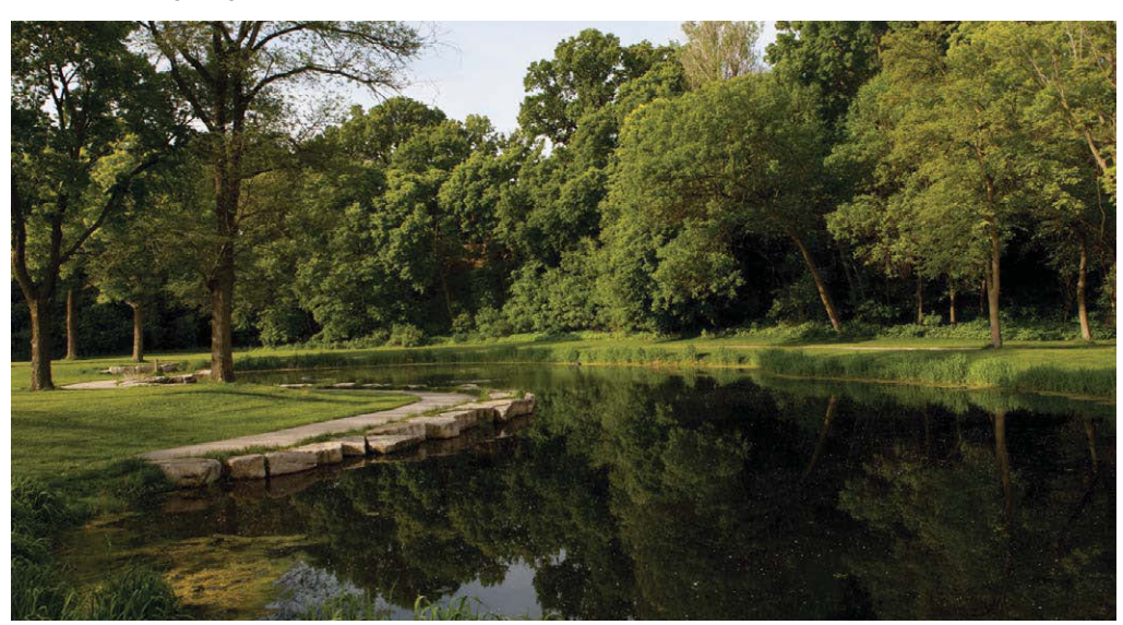
Towl Park near West Center and 93rd streets is a small, scenic lake that offers good panfishing, making this destination a perfect spot to take children.

Notes: This small pond in north Omaha has good water quality and solid panfishing for introducing youngsters.