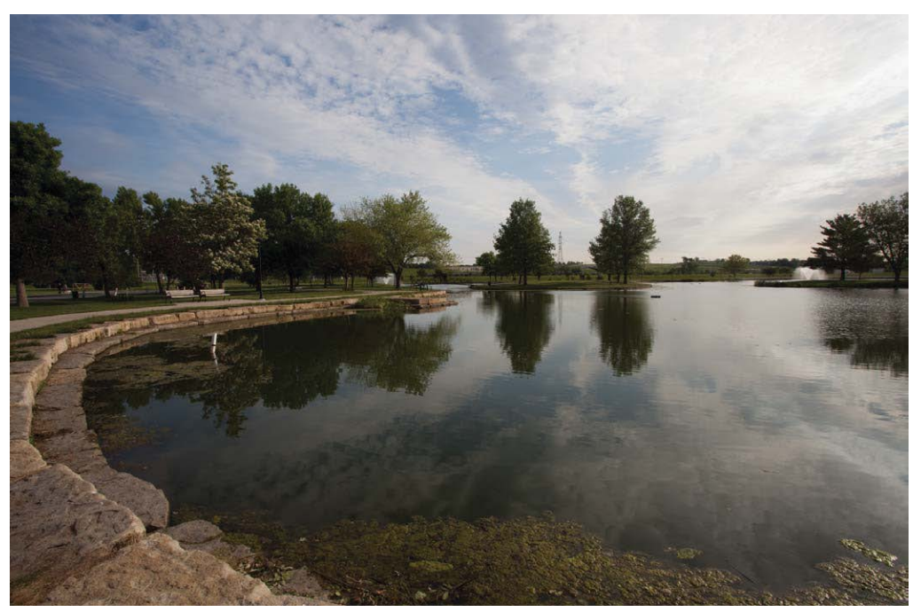
Because of Lake Halleck's abundant shoreline access, the Nebraska Game and Parks Commission frequently uses this lake for its family fishing nights. For more information about this program, visit OutdoorNebraska.org and click on Fishing.

Notes: Schwer has some nice crappie and largemouth bass,