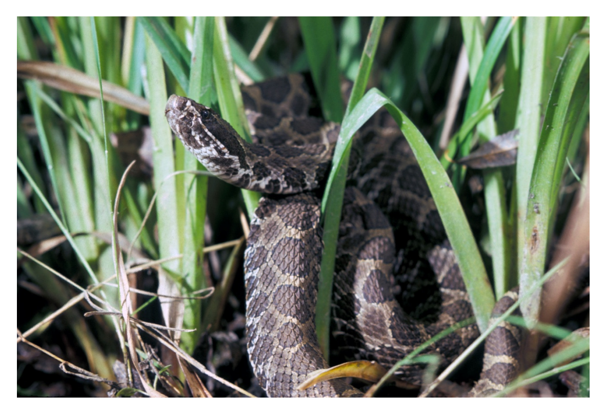
FIGURE 1. Western Massasaugas have a grayish-brown base and dark blotches.