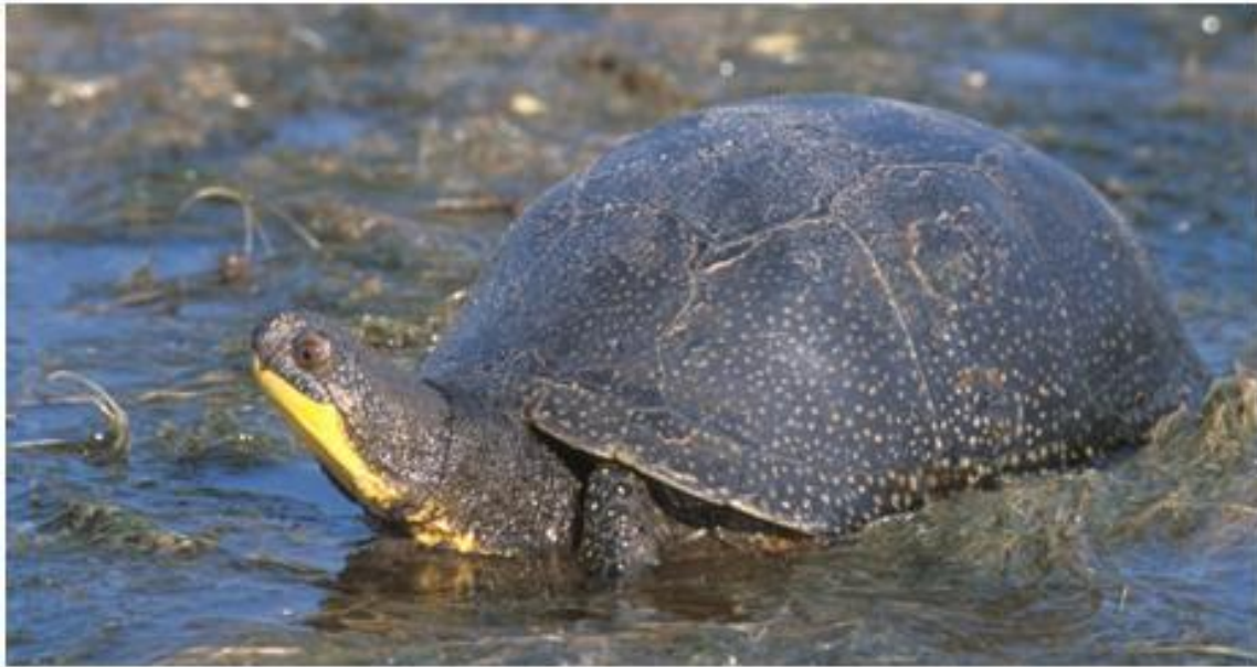
FIGURE 2. The Blanding's Turtle has a distinctive bright yellow chin and throat.

yellow plastron is hinged, and it is slightly concave on males. The neck is long and head somewhat flattened with protruding eyes. See Figure 2.